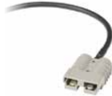
1 x High current flylead