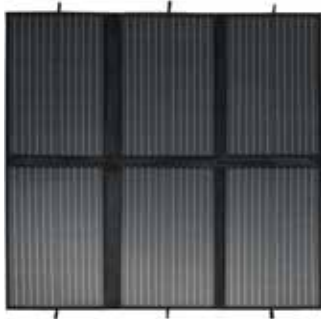
1x Blanket Solar Panel