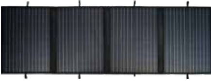
1x Blanket Solar Panel