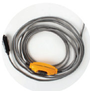
Extra long power supply cord (5m)