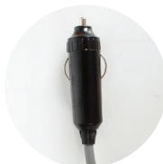
12V car cigarette connection