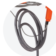
2m Water Hose