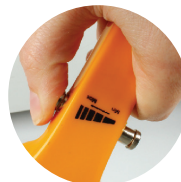
Adjustable water pressure