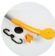
Hands Free Mounting Options