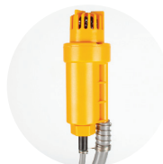
Submersible quiet water pump