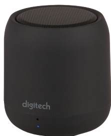
1 x Mini Rechargeable Speaker