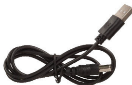
1 x USB Charging Cable