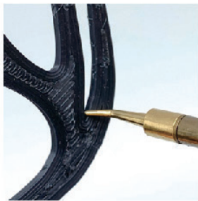
C: Stencil Cutting Tip