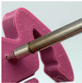
A: Point Tip