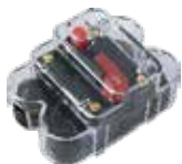
E Circuit Breaker Protector