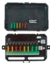
B Circuit Control Box