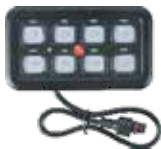
A Switch Panel