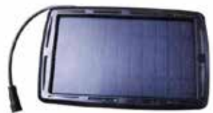
1x Solar Panel