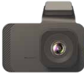
1 x Dash Camera