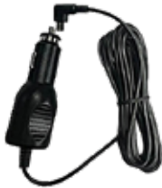
1x 12v Power Adapter