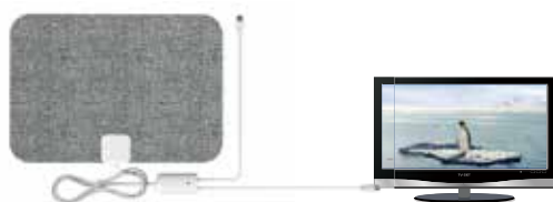
Installation 1: Directly connected to TV