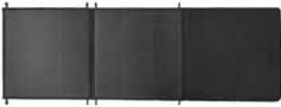
1 x Blanket Solar Panel