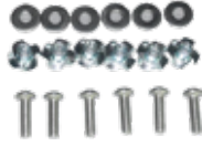
Mounting Kit 6 x M6 washers 6 x M6 tee nuts 6 x M6 x 20mm bolts