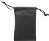
1 x Carry Pouch