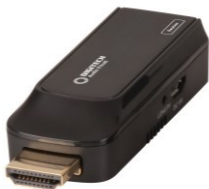
1 x HDMI Receiver