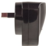
1 x USB Mains Power Adaptor