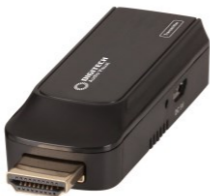
1 x HDMI Transmitter